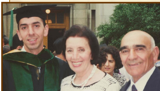
The rents and me at University Michigan - Ann Arbor (med school) Graduation