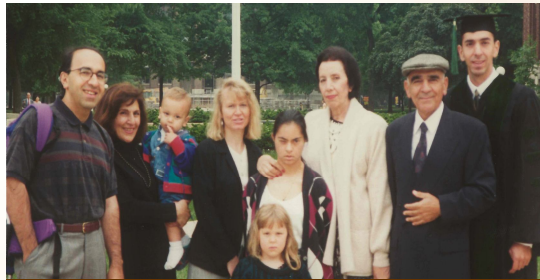
My Family & I at University Michigan - Ann Arbor (med school) Graduation

Of course, my college experience would not be complete without sharing with you how I ended up at University of Michigan for medical school. Getting into medical school was competitive and I was fortunate enough to have choices for some of the top schools. I don't remember my exact criteria other than just the best school possible. My top three were Stanford, University of Chicago and