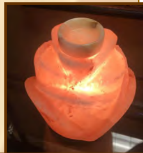
The office salt lamp shaped as a rose